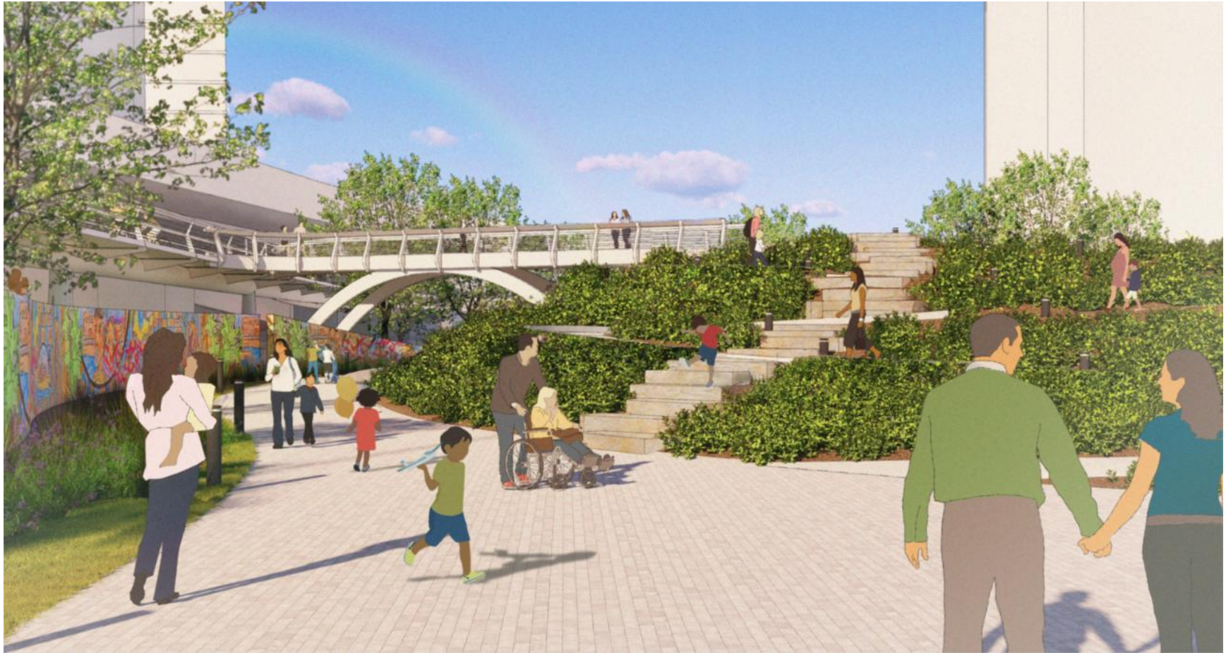
Flyover Connection & Mural Wall